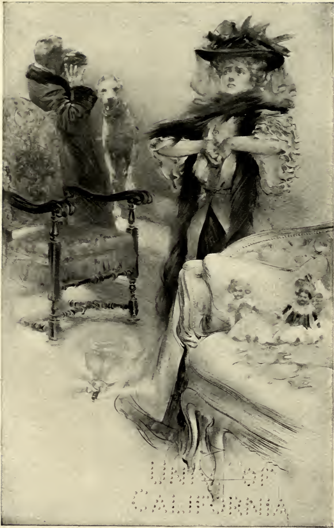
“With the acrid smell of smoke choking her.”